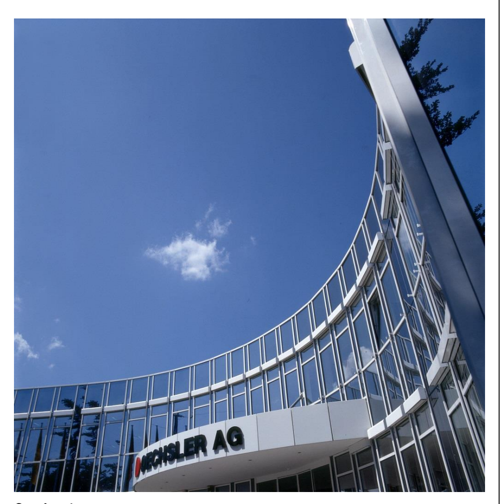
Caption 1: Supplier from Central Franconia implements CADENAS' 3D similarity search to optimize the offer management.